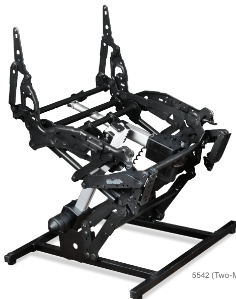
5542 (Two-Motor Lift)