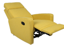
Single Love Seat