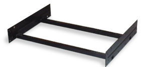
Arm-mounting chassis - available in all sizes listed above.