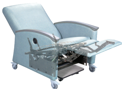
Rocker option – #4154 No Trendelenburg option

The Patient's Choice Healthcare Mechanism Line, available for treatment chairs, rockers, and Wall Hugger furniture, offers geometrically balanced mechanisms to allow the occupant's weight to balance operation instead of springs. Its wide heavy-gauge links are designed for safety without pinch points.