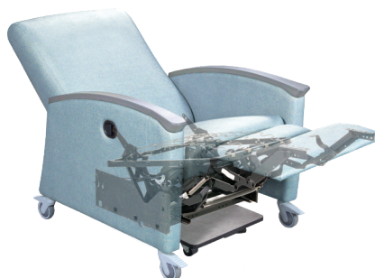
Wall Hugger® option – #4304/8652 No Trendelenburg option