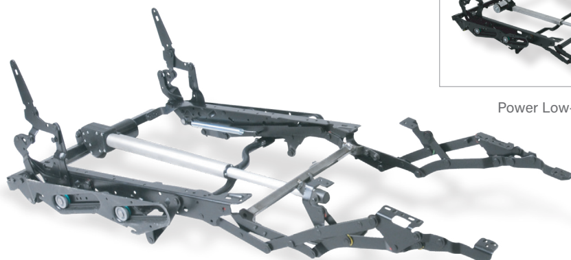
Power High-Leg (3542)