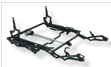
Power Low-Leg (3527)